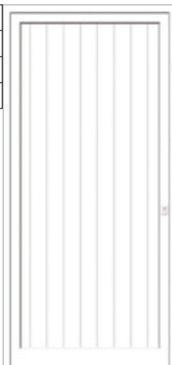
FU RAINURÉ RAL vertikaal / vertical