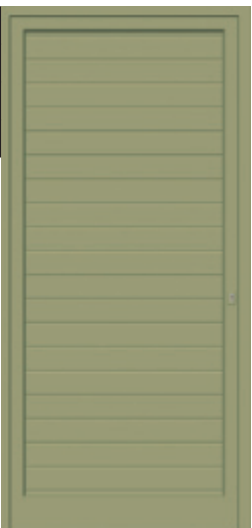
FU RAINURÉ RAL horizontaal / horizontal