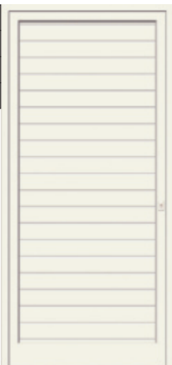
FU RAINURÉ RAL horizontaal / horizontal